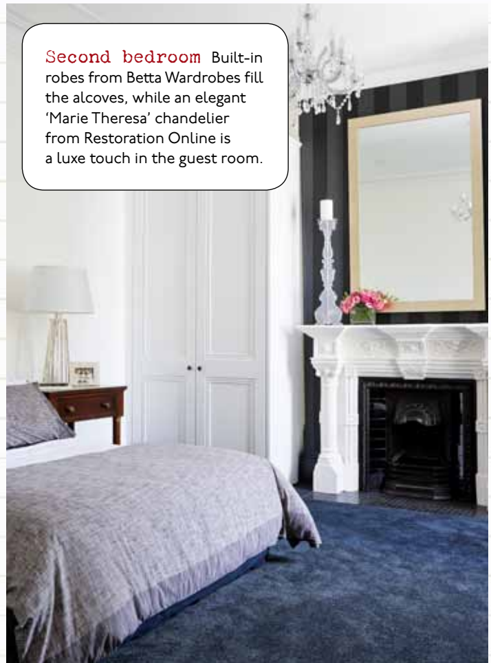
Second bedroom Built-in robes from Betta Wardrobes fill the alcoves, while an elegant 'Marie Theresa' chandelier from Restoration Online is a luxe touch in the guest room.