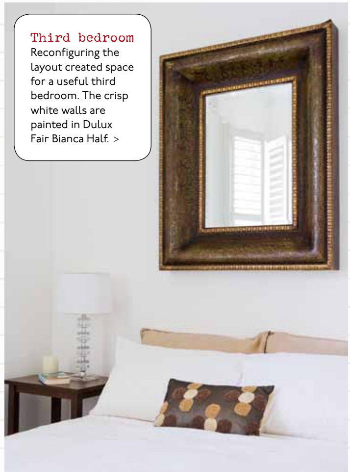
Third bedroom Reconfiguring the layout created space for a useful third bedroom. The crisp white walls are painted in Dulux Fair Bianca Half. >